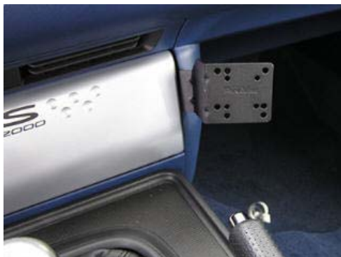
InDash with door closed